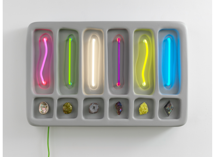
Esther Ruiz, Codex , 2023, MDF, neon, red abalone, jasper, geode, rainbow aura quartz, sulfur, labradorite, epoxy clay, electronic components, paint, 24 x 38 x 6 inches, Courtesy the artist and CHART. Photo by Elisabeth Bernstein.

The Aldrich Contemporary Art Museum is pleased to announce Esther Ruiz's first solo museum presentation on the East Coast, Uncharted . Ruiz's presentation is the eighth installment of Aldrich Projects, a quarterly series featuring one work or a focused body of work by a single artist on the Museum's campus. Debuting new sculptures from her Beacon series alongside Codex (2023), these enigmatic objects consider the relationships between the natural and the artificial, the familiar and the alien, and the temporal and transcendental. Esther Ruiz: Uncharted will be on view May 8 to September 2, 2024.