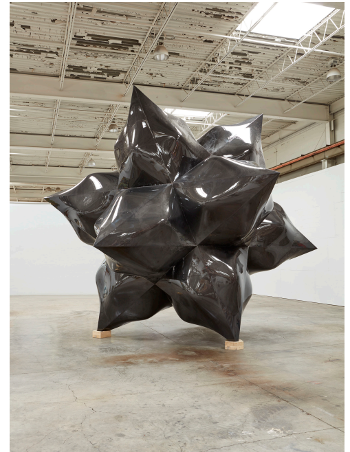
Frank Stella, Fat 12 Point Carbon Fiber Star , 2016. Courtesy of the artist and Marianne Boesky Gallery, New York and Aspen © 2020 Frank Stella / Artists Rights Society (ARS), New York. Photo credit: Jason Wyche

Stella's use of the star form emerged during his first decade in New York as he was exhibiting his groundbreaking striped and shaped paintings. It then vanished and resurfaced many decades later at a moment when he committed himself to three-dimensional abstraction. Today, the star is the lead in scores of works from small objects to towering sculptures. Scaled to the table or the open air, Stella's star works transport us—we imagine how disparate elements shift, how parts are assembled, how paint is applied. The works parade an outsized material resourcefulness that collapses analogue and twenty-first century fabrication techniques: RPT (rapid prototype technology) plastics, teak, aluminum, stainless steel, birch plywood, fiberglass, carbon fiber, and more. With their automotive neon hues, shimmering and natural finishes, the stars, big and small, flex and project a spatial dynamism that intimates a potential maneuverability—as if they were built to perform.