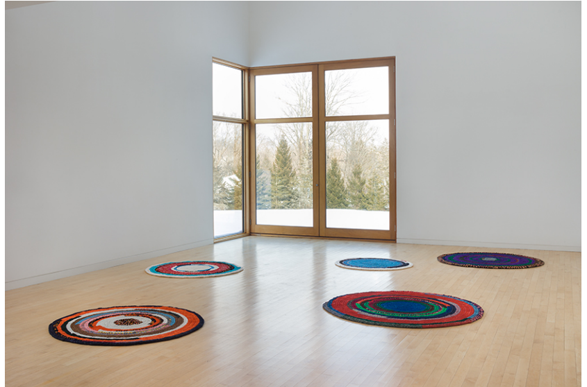
Harmony Hammond, Material Witness: Five Decades of Art , The Aldrich Contemporary Art Museum, March 3 to September 15, 2019 (installation view, left clockwise, Floorpiece V; IV; II; III; VI , all 1973) Courtesy of the artist and Alexander Gray Associates, New York © 2018 Harmony Hammond / Licensed by VAGA at Artists Rights Society (ARS), NY. Photo: Jason Mandella

Hammond has described the Floorpieces as her “most radical works,” as they “negotiate a space between painting and sculpture” and “between art and craft.” Their circular braided forms reference rag rugs, but are subtly oversized. Hammond braided knit fabric (scavenged from city dumpsters in the garment district south of Houston Street), stitched the braids into coils, and then partially painted the surface with acrylic, leaving sections of the colorful and patterned fabric uncovered. Considered as very flat sculptures or paintings, presented off the wall, five of the original seven Floorpieces will be installed together for the first time at The Aldrich in a double-height gallery, offering an expansive aerial view.