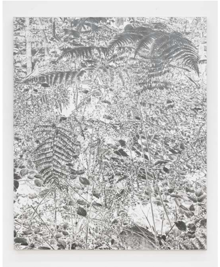
Martin Beck time , 2024

Sculptural and installation-type interventions span the entirety of the Museum's first floor galleries. Beck's large-scale pencil drawings layer the vocabulary of self-care and self-control onto meticulously rendered immersive fern patches, a suite of wall works fragment images of sunsets and thunderstorms that adorn the covers of the environments records. His video, in place (environments) , traces the atmospheric shifts made possible by sonic overlays and point to the paradoxes that institutional and private spaces—from spas to galleries to prisons—might have in common.