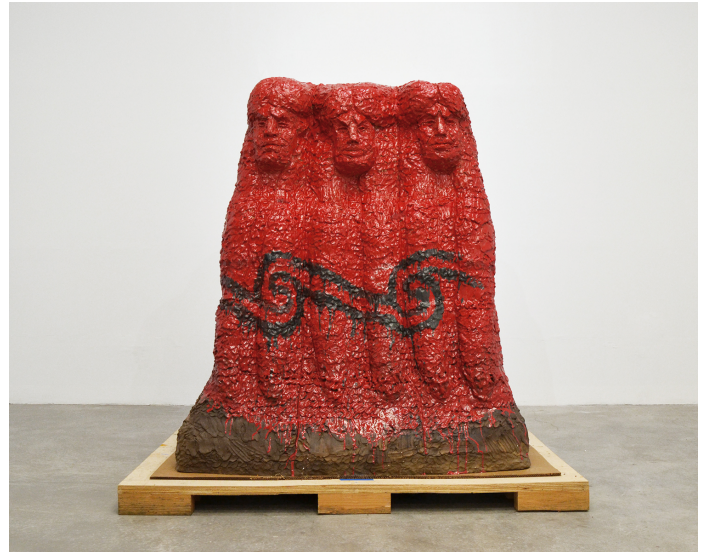
Raven Halfmoon, Weeping Willow Women , 2022, Stoneware, glaze, 72 x 70 x 46 inches. Courtesy of the artist and Kouri + Corrao Gallery

The Aldrich Contemporary Art Museum is pleased to announce Raven Halfmoon: Flags of Our Mothers featuring new and recent works made over the last five years. This exhibition is co-organized by The Aldrich Contemporary Art Museum and Bemis Center for Contemporary Arts, where it will be on view May 18 to September 15, 2024. Commissioned by The Aldrich and Bemis Center, the exhibition will debut Halfmoon's largest works to date, including a three-part stacked ceramic sculpture standing over twelve-feet tall. Raven Halfmoon: Flags of Our Mothers will be on view at The Aldrich from June 25, 2023, to January 7, 2024.